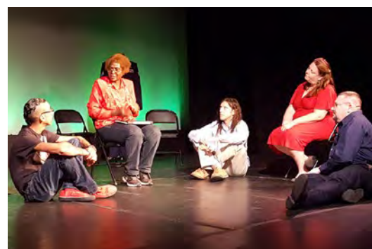
Four Orlando-area veterans and a Gold Star mother share riveting stories of life and the military on stage in “Telling: Orlando.”