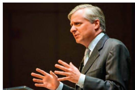
Author Jon Meacham speaks to a Miami audience about U.S. presidential leadership through history.